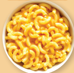
Macaroni & Cheese with Favorite Toppings