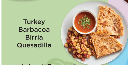
Turkey Barbacoa Birria Quesadilla