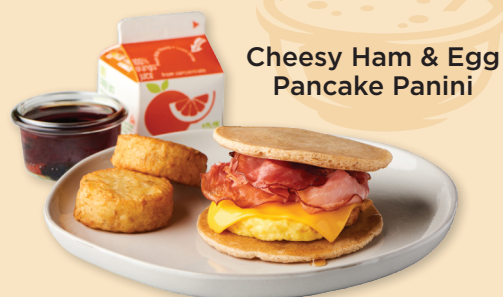
Cheesy Ham & Egg Pancake Panini

is more than just for the cafeteria! It can be served in the classroom or as a grab-and-go meal from a cart in the hallway. Whatever a school needs, there's a menu to support!