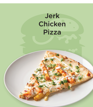
Jerk Chicken Pizza