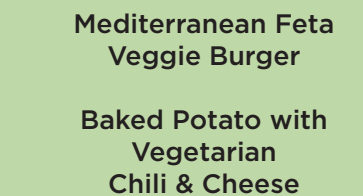
Mediterranean Feta Veggie Burger