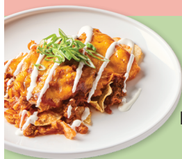
Cheesy Chorizo Enchilada Bake