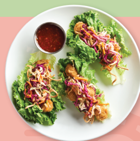
Sweet Chili Chicken Lettuce Wraps