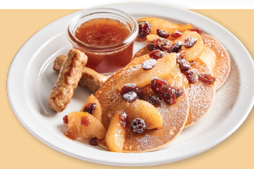
Fall Brunch Plate