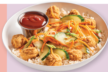
Chicken Katsu Bowl

Here are a FEW HIGHLIGHTS of the EXCITING FLAVORS students will enjoy this semester