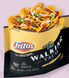
Beef, Chili & Cheese Fritos Walking Taco